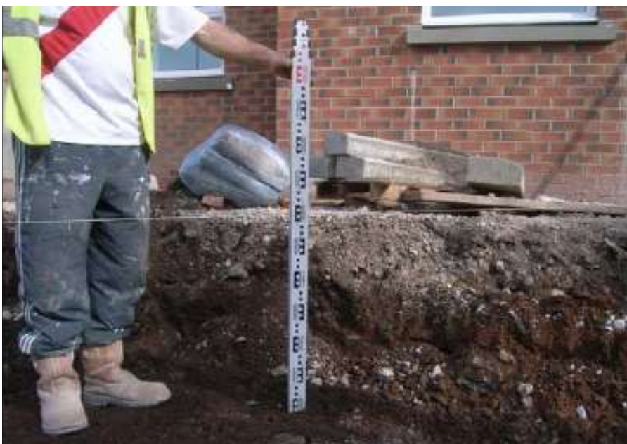
Photograph 4: Depth check of inert cover within areas of front gardens.