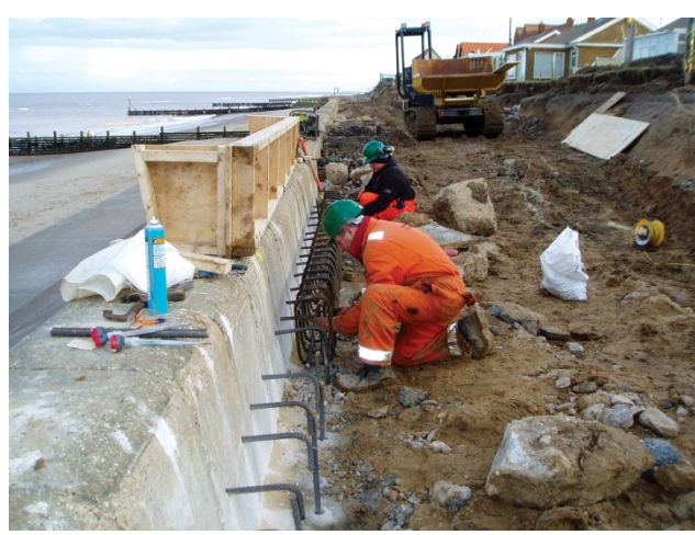
Above: Repairs taking place at Walcott