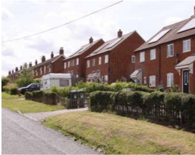
13 Recent affordable housing Heydon Road