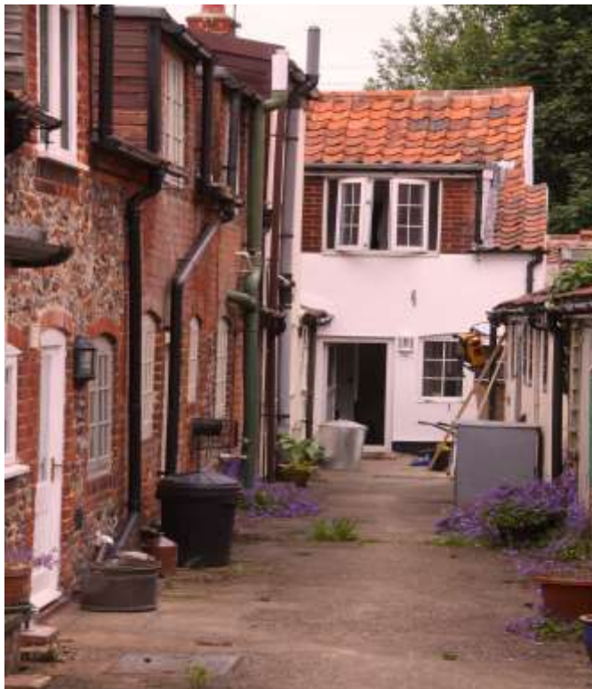
19 Typical yard Corpusty