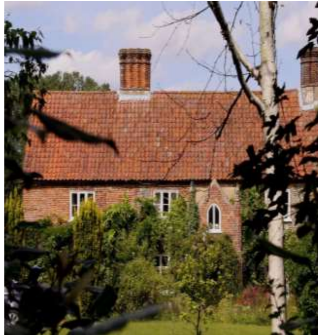
10 16 th Century brick and pantile Manor House Corpusty