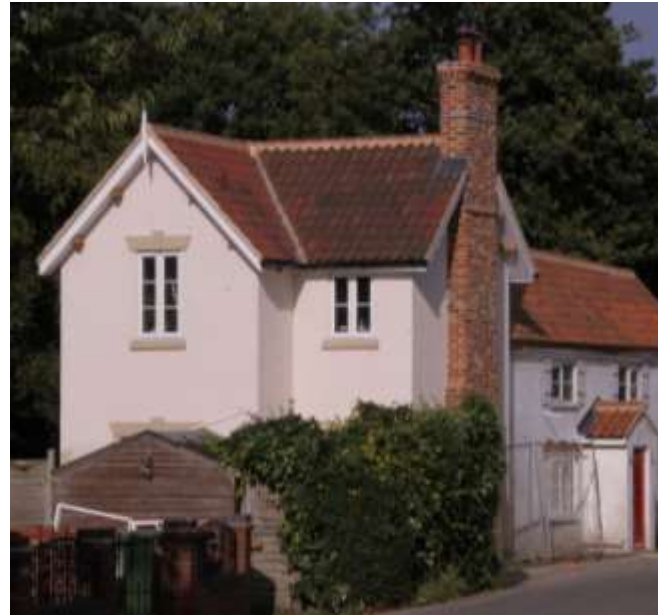
18 Modern extension to cottage retaining original features and sympathetic use of stucco