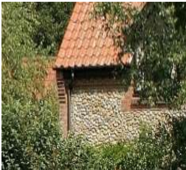
2 brick and flint construction with pantile roof