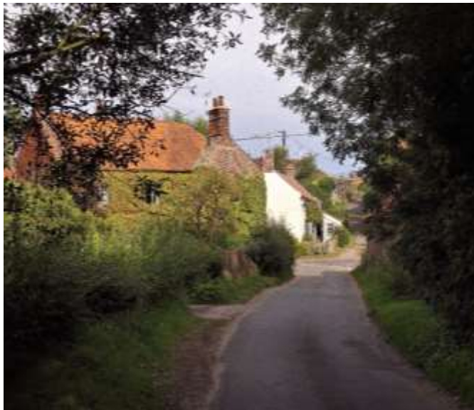
15 Eclectic architectural view showing gable ends, chimneys lean-to extension and surrounding greenery