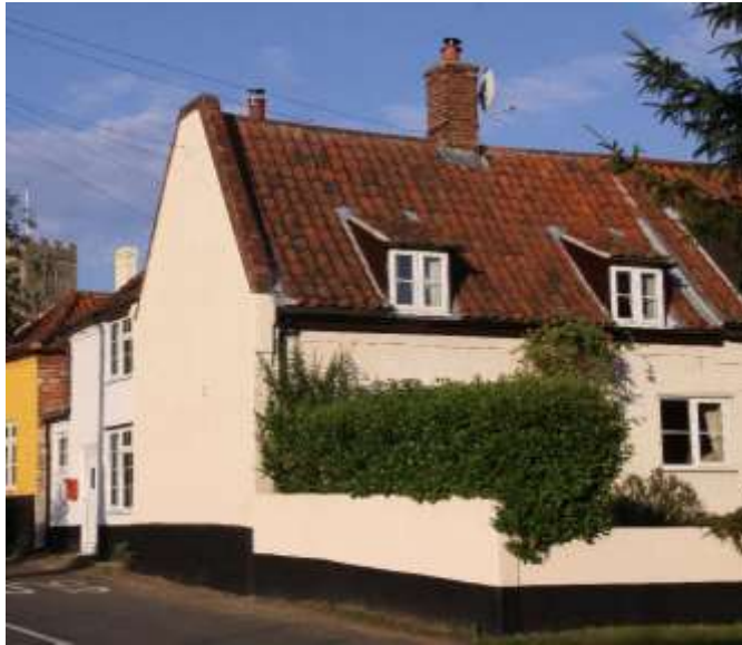
5 End of terrace forming entrance to Great Yard showing wedge dormer windows in Pitched roof