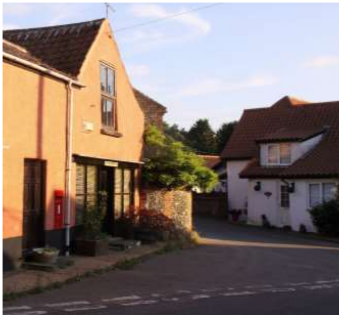
7 Old Post office with stucco exterior