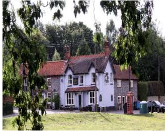
14 The pub from the green