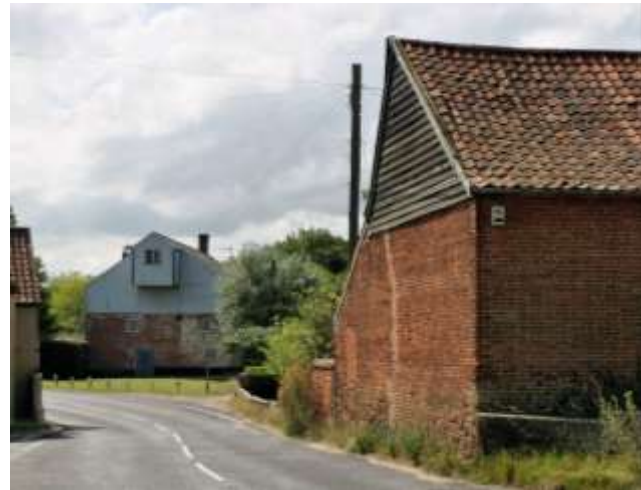
3 Wooden cladding and brick on mill and barn