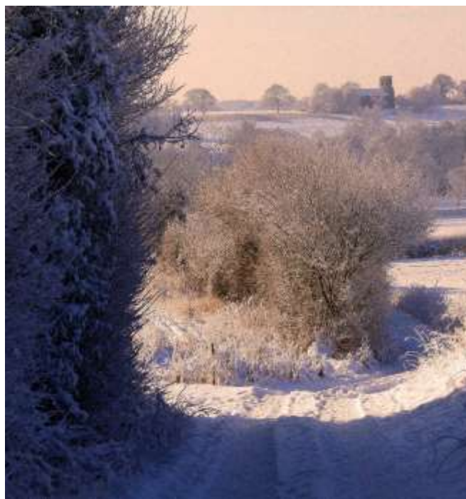
22 View of St.Peter's church from Monks Lane