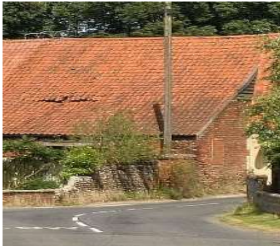
1 brick with pantile roof