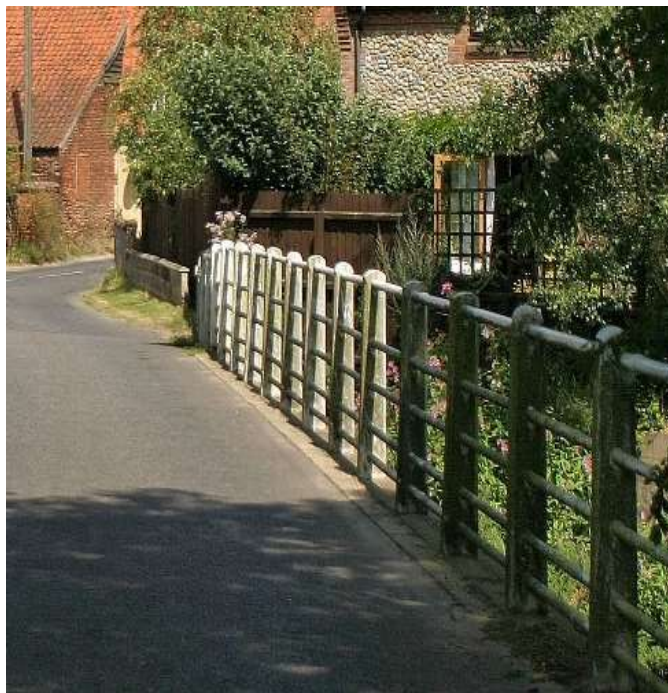
21 Bridge railings over the Bure between Saxthorpe and Corpusty