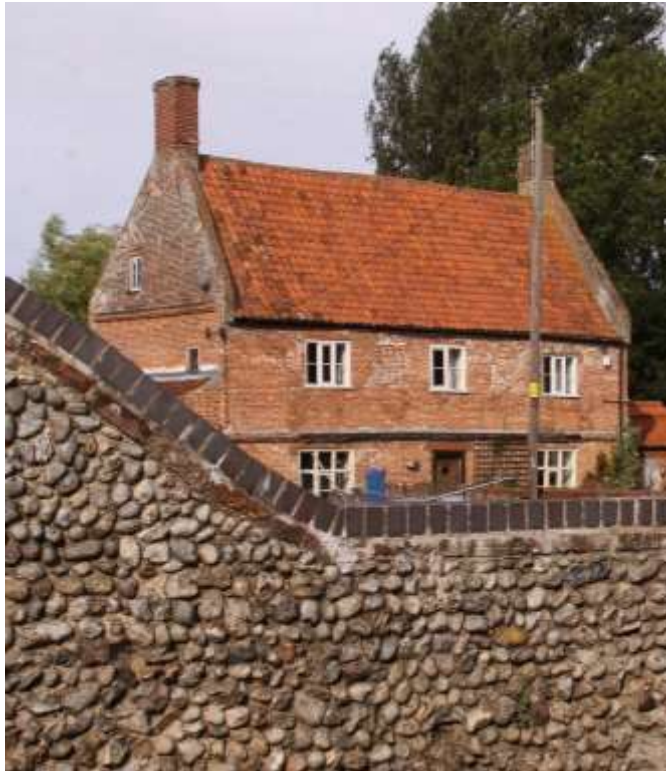
17 Seventeenth Century farmhouse showing flint wall