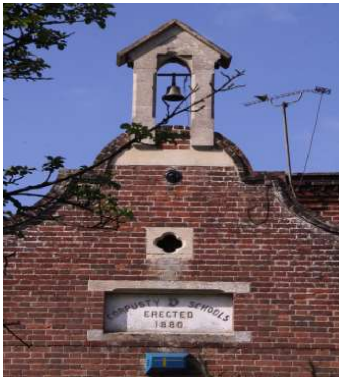
11 Dutch Gable on Village school