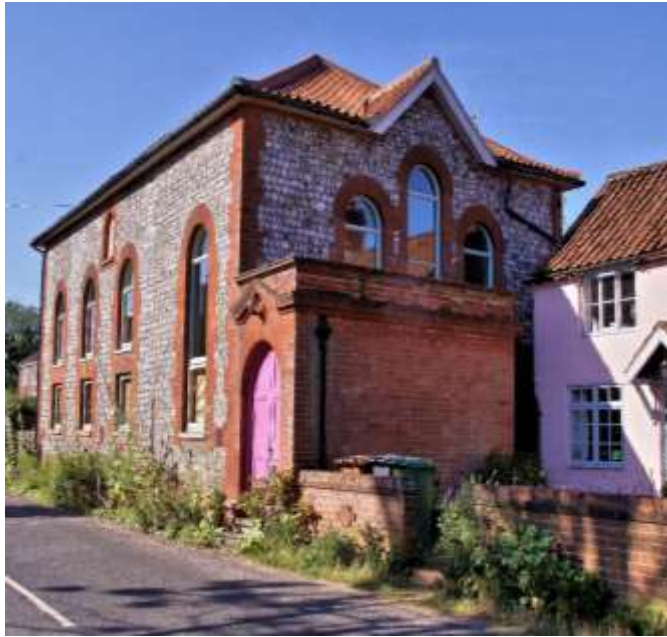
9 Juxtaposition of Pink Cottage with 19 th Century Methodist Chapel demonstrating simple cantilevered porch