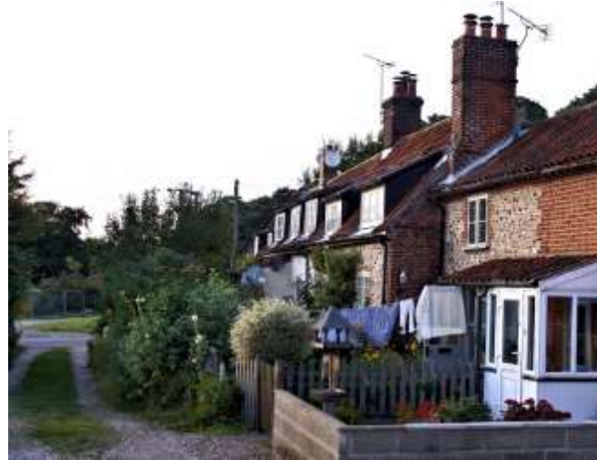
6 Great yard showing typical terraced cottages with wedge dormers and common access